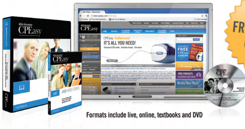
Formats include live, online, textbooks and DVD